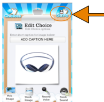
Image is now added to the choice board.

Step 7: Click "SAVE" one more time to add the sound to the image and return to the schedule you are adding the image to.