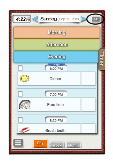
Home Screen & Edit Button

2. Create an event by tapping the "EDIT" button in the upper right corner of the screen. You will then go to the "Edit an Event Screen".