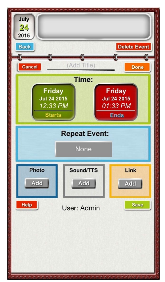
Edit Event Screen

Note: Tap "Save" before returning to the home screen to ensure all changes are saved.