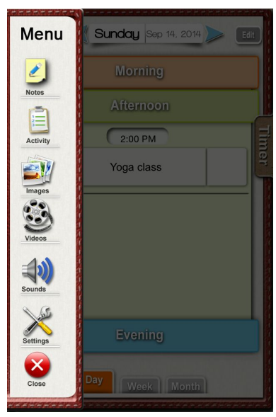
Notes, Activity, Images, Video, Sounds